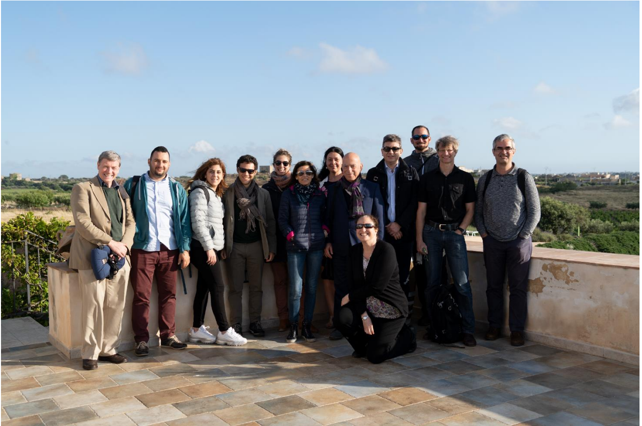
The EHUSEA EM WG. National Research Council of Italy, Institute for the Study of Anthropic Impacts and Sustainability in the Marine Environment, Capo Granitola (TP, Italy), 27-29 May 2019.