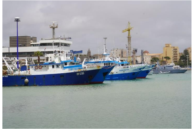
The EHUSEA EM WG. National Research Council of Italy, Institute for the Study of Anthropic Impacts and Sustainability in the Marine Environment, Capo Granitola (TP, Italy), 27-29 May 2019. Visit to Mazara del Vallo fishing harbor.