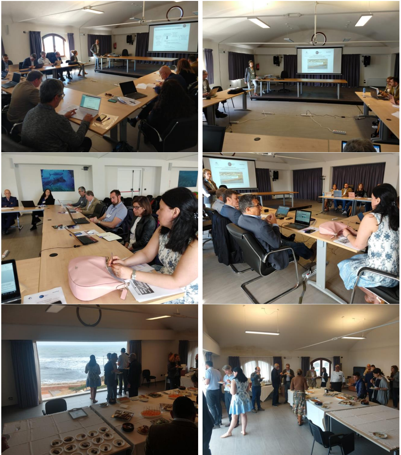
The EHUSEA EM WG. National Research Council of Italy, Institute for the Study of Anthropic Impacts and Sustainability in the Marine Environment, Capo Granitola (TP, Italy), 27-29 May 2019.